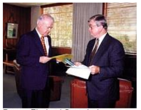
Former Electoral Commissioner Bill Gray returns the writs for the 1999 referendum to the Governor-General, Sir William Deane.

No States recorded a YES vote. Nationally 39.34% of electors voted YES.