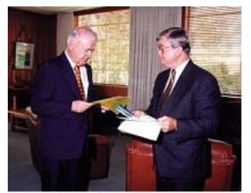
Former Electoral Commissioner Bill Gray returns the writs for the 1999 referendum to the Governor-General, Sir William Deane.

No States recorded a YES vote. Nationally 39.34% of electors voted YES.