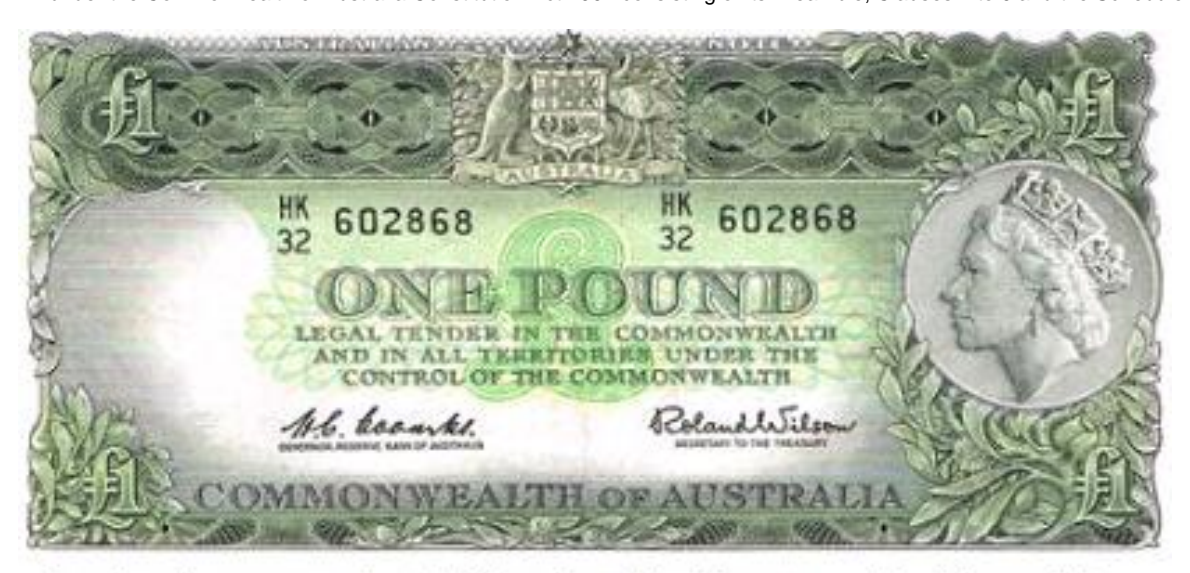
Legal tender guaranteed by the "Crown" and the "Commonwealth of Australia"