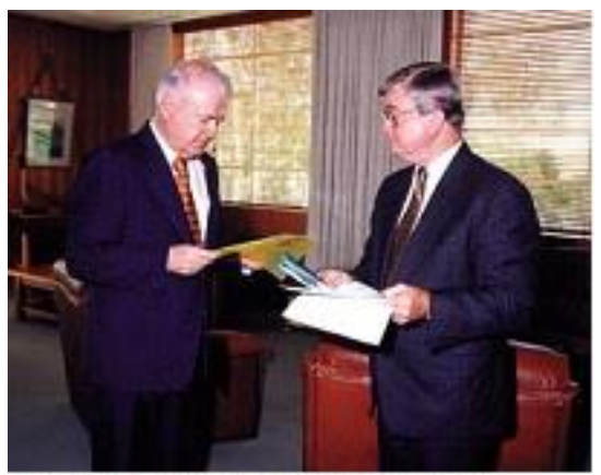
Former Electoral Commissioner Bill Gray returns the writs for the 1999 referendum to the Governor-General, Sir William Deane.

No States recorded a YES vote. Nationally 39.34% of electors voted YES.