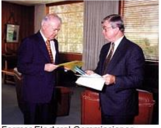
Former Electoral Commissioner Bill Gray returns the writs for the 1999 referendum to the Governor-General, Sir William Deane.

No States recorded a YES vote. Nationally 39.34% of electors voted YES.