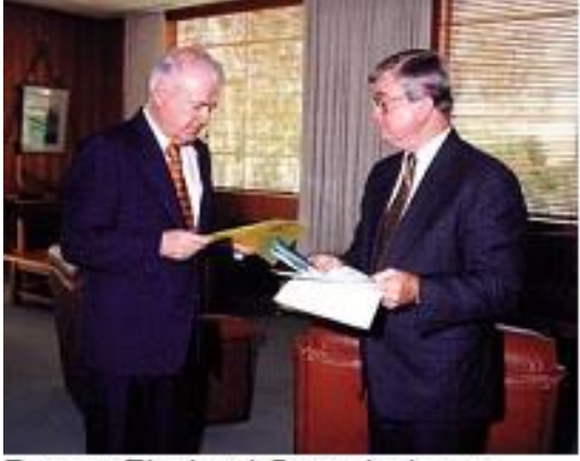
Former Electoral Commissioner Bill Gray returns the writs for the 1999 referendum to the Governor-General, Sir William Deane.

No States recorded a YES vote. Nationally 39.34% of electors voted YES.